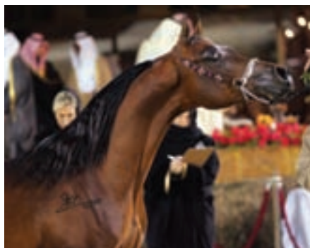
Bottom, Right: Numas Al Thani (Sabea Al Sahraa Anapura x Shamilah), First Place 1-Year-Old Colt, bred and owned by King Abdullah bin Abdulaziz & Sons, Kingdom of Saudi Arabia.