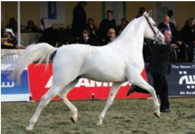
Rezaiq (Haleem x Zhuriya), First Place KSA Desert-Bred Stallion, bred and owned by King Abdul Aziz Arabian Horse Center, Kingdom of Saudi Arabia.