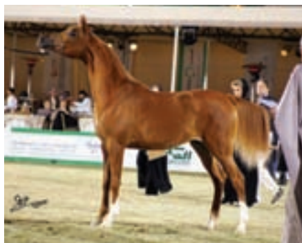
Bottom, Right: Bint Najd (Koronec x Rayanah), First Place 1-Year-Old Filly (b), bred and owned by King Abdullah bin Abdulaziz & Sons, Kingdom of Saudi Arabia.