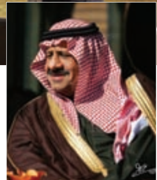
Right: HRH Prince Khaled bin Sultan bin Abdul Aziz Al Saud, the host of the First Al-Khaleidiah International Arabian Horse Show.

animals, and the “lodge” is actually a huge building with an ornate dining room and floor-to-ceiling glass windows for viewing the animals. The Prince personally greeted each and every guest and proved to be very friendly and well-spoken.