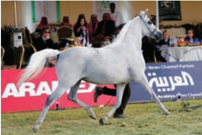
Mandouba (Haleem x Okbt Al-Nadba), First Place KSA Desert-Bred Mare, bred by HRH Prince Ahmed bin Abdulaziz, Kingdom of Saudi Arabia, and owned by HRH Prince Ahmed Abdulaziz Al Saud, Kingdom of Saudi Arabia.