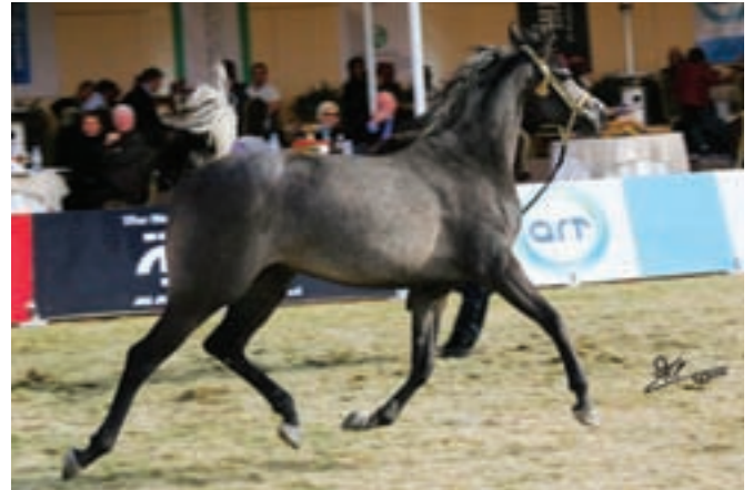
Bint Khuzamah (Rezaiq x Khuzamah), First Place KSA Desert-Bred Filly, bred and owned by King Abdul Aziz Arabian Horse Center, Kingdom of Saudi Arabia.