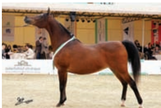
Bottom Right: Bilkis Begum (Khidar x Nur Jahan), First Place Mare 4-6 Years Old (a), bred by Balmaseda, Spain, and owned by HRH Prince Khaled bin Sultan bin Abdulaziz Al Saud, Kingdom of Saudi Arabia.