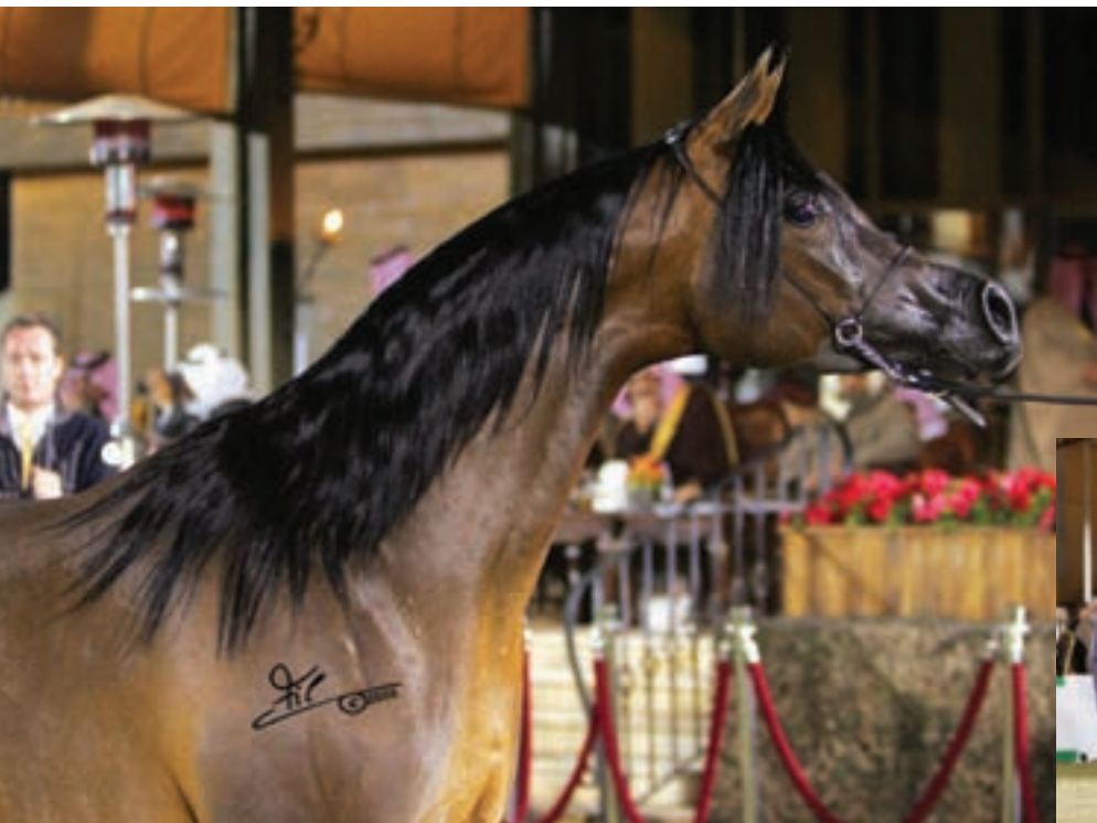
Left and Below: Pianissima (Gazal Al Shaqab x Pianosa), Senior Mare Champion, bred and owned by Janów Podlaski Stud, Poland.