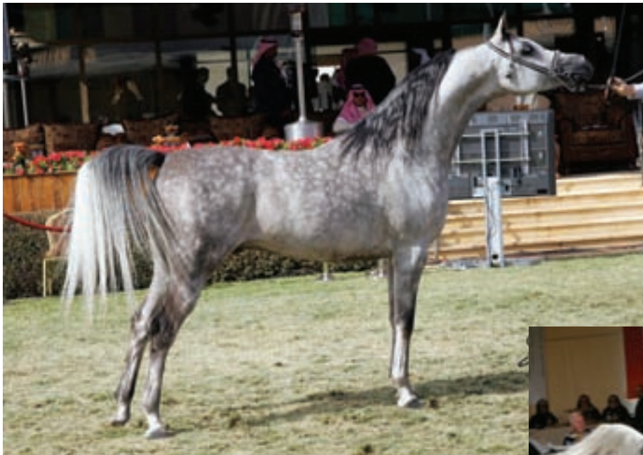
Left: Esparto (Ekstern x Ekspozycja), Senior Stallion Reserve Champion, bred by Michalów State Stud, Poland, and owned by Ajman Stud, U.A.E.