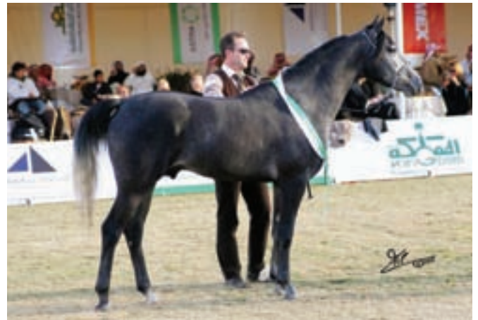
Majd Al Kbalidiah (Rahi x Meraisla), First Place KSA Desert-Bred Stallion, bred and owned by HRH Prince Khaled bin Sultan bin Abdulaziz, Kingdom of Saudi Arabia.