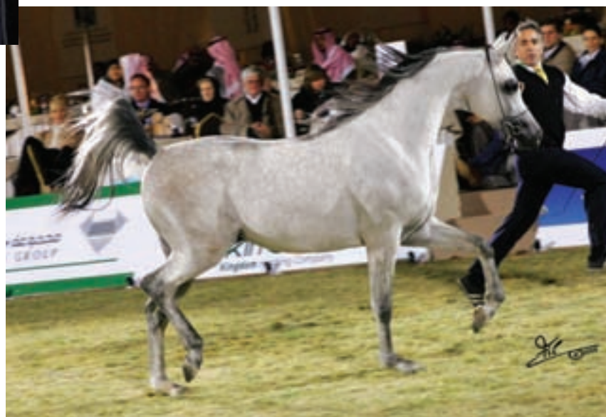
Bottom, Left: Ataa Al Khalidiah (Aja Sangali x Mashael Al Khamisa), First Place 2-Year-Old Colt (a), bred and owned by HRH Prince Khaled bin Sultan bin Abdulaziz, Kingdom of Saudi Arabia.